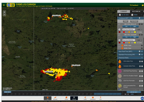
SNPP and NOAA-20 VIIRS active fire detection locations in Western Ontario symbolized by their time since detection at ~19:00 CDT June 30, 2021